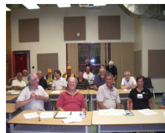
Information Session for Managing Partners

To see a map of what section they manage check out our website.