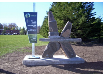
Marg Fevang Memorial Inukshuk

www.kawarthatranscanadatrail.ca for details