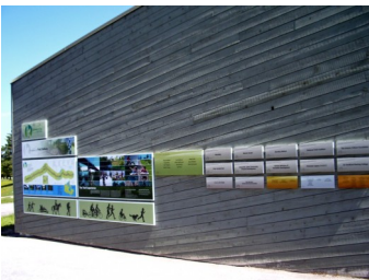
The Fred DeNure Donor Wall at Fleming College.

www.kawarthatranscanadatrail.ca for details