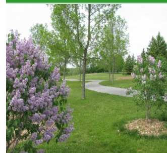
KTCT travels through the Lilac Gardens of Lindsay.