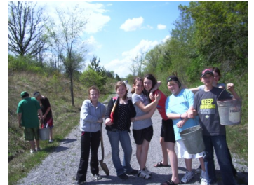
Students plant trees and shrubs along the KTCT.