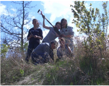
Volunteers are a valuable part of KTCT