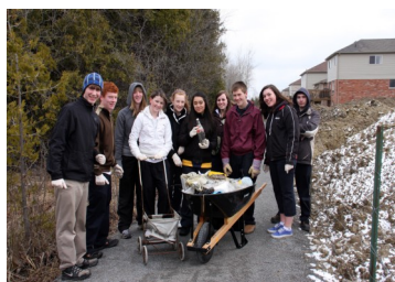
Students from St. Thomas Aquinas Secondary School shown here removing trash from alongside the trail on Earth Day. In fact they pulled out of the ditches over 60 vehicle tires