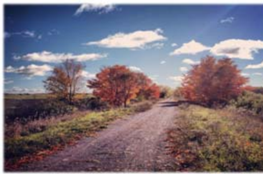
To collect vegetation data the Fleming team biked along the trail surveying.

Vegetation management is an important part of trail maintenance. Proper trail maintenance leads to sustainability of the trail, which in turn is linked to the overall health of the surrounding environment.