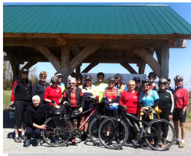
The Biker Babes after riding the west section of the KTCT in May.